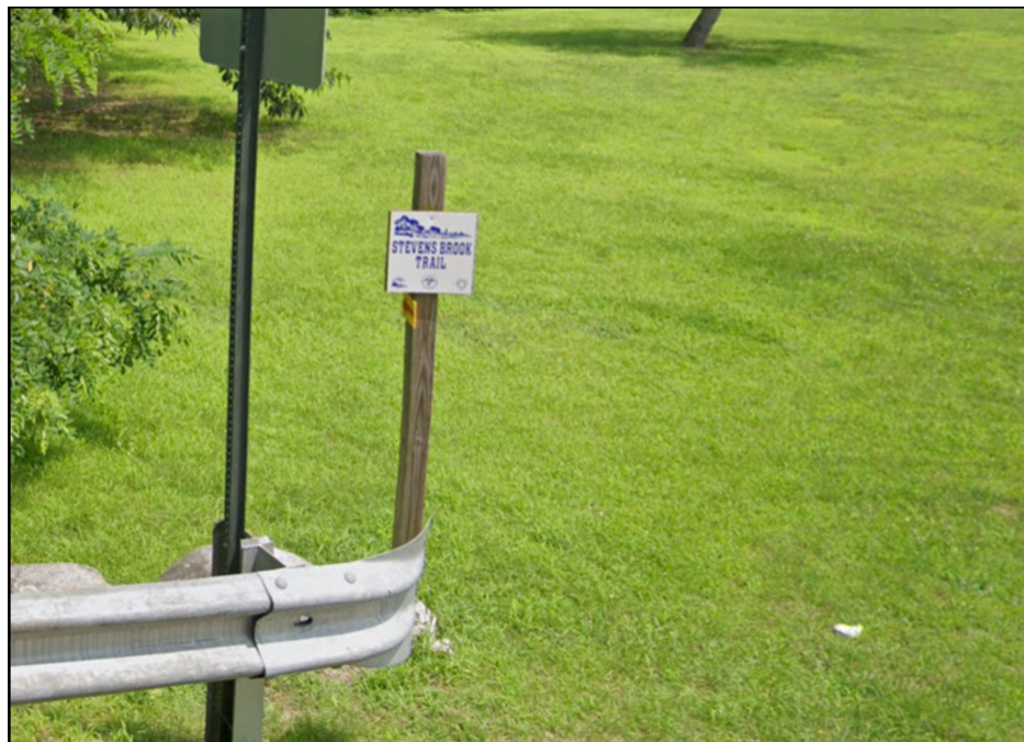
Stevens Brook Trail

Additionally, the MaineDOT would require approximately 0.05 acres and 457 SF for temporary construction rights for construction access and activities at the northwest corner of the bridge and the southeast corner of the bridge, respectively.