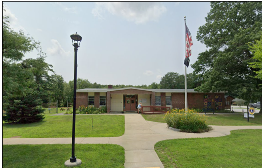
Bridgton Memorial U.S. Army Reserve Center

Additionally, the MaineDOT would require approximately 0.05 acres for temporary construction rights for construction access and activities.